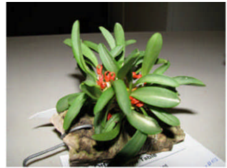
Image on the right is that of Specklinia tribuloides grown by Angèle Biljan, photo taken by Arlene Lang.

All of Arlene's images have been reduced in size by as much as 80 to - 85% in order to fit in this newsletter. To see the exceptional detail of the flowers, you have to view Arlene's images in their full size to fully appreciate her mastery of the digital camera. Some of Arlene's flowers sparkle as if made from fine crystal. Is this what insects see?